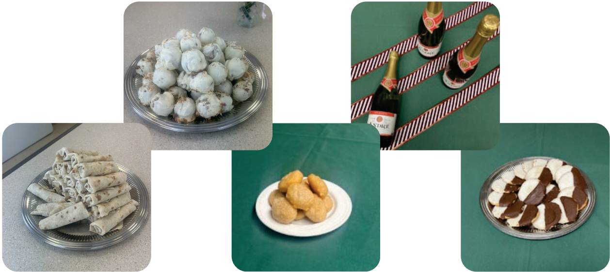
Lefsa and Pumpkin Truffles -Harvest Fest

Throughout the last quarter our Nutrition Department has continued serving up delicious food and keeping our residents well nourished. From special events such as Harvest Fest and New Years Eve Parties, to special meals for the holiday season, they continue to serve up some delicious mouthwatering meals. Check out these featured dishes from the last couple months. Our compliments to all our nutrition department staff for serving up some great meals and treats!